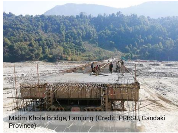
Midim Khola Bridge, Lamjung