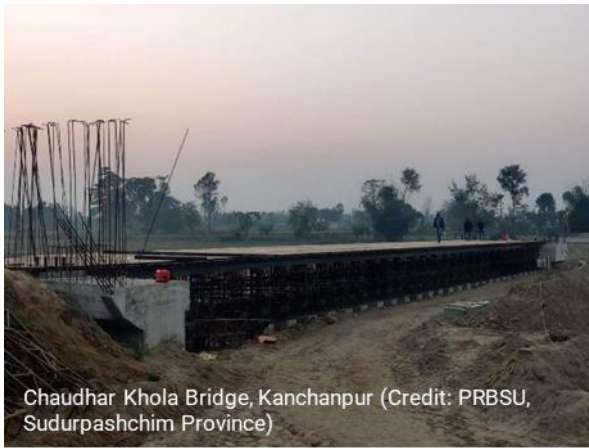
Chaudhar Khola Bridge, Kanchanpur

Fiscal Year 2079/80 | 16 July 2022 to 15 July 2023