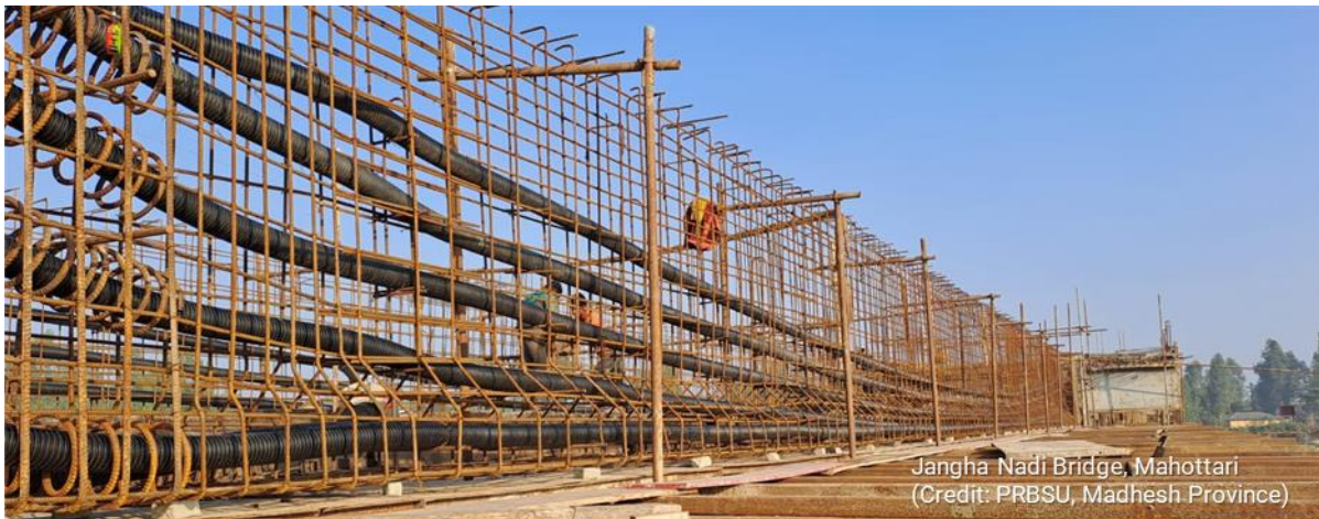
Jangha Nadi Bridge, Mahottari